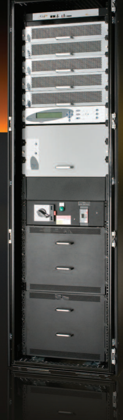
POWER+ AC to AC Efficiency